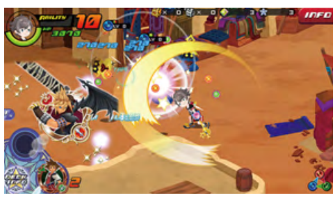
KINGDOM HEARTS Unchained \chi ©Disney Developed by SQUARE ENIX