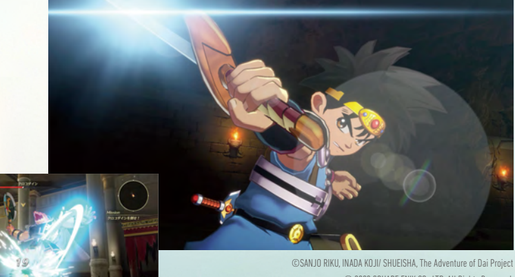
© 2023 SQUARE ENIX CO., LTD. All Rights Reserved.

Platforms: PlayStation®5/PlayStation®4/ Nintendo Switch™/Xbox Series XIS/ Microsoft Store Launch: September 28, 2023 Platforms: Steam® Launch: September 29, 2023