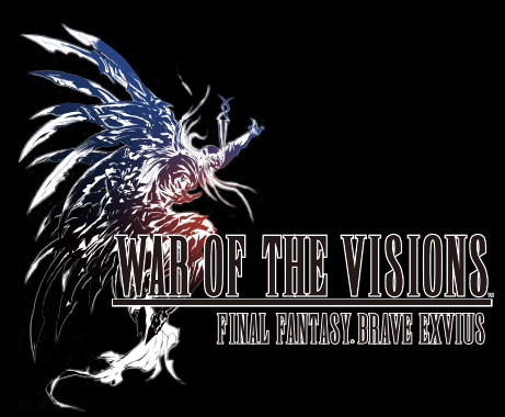
Platforms: iOS/Android/PC © SQUARE ENIX Co-Developed by gumi Inc. LOGO ILLUSTRATION:© YOSHITAKA AMANO