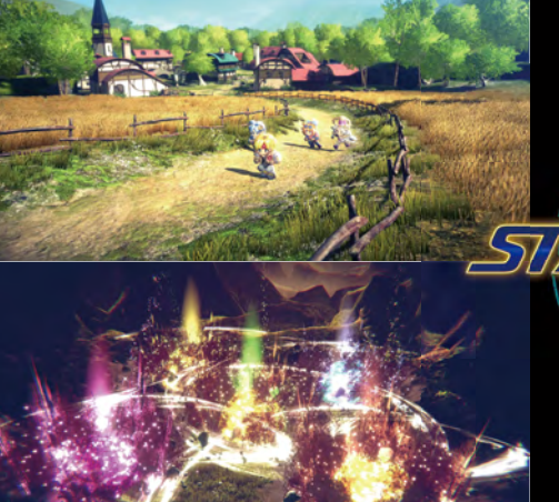
Platforms: PlayStation<sup>®</sup>5/PlayStation<sup>®</sup>4/Nintendo Switch<sup>™</sup> Launch: November 2, 2023 (tentative) Platforms: Steam<sup>®</sup> Launch: November 3, 2023 (tentative)