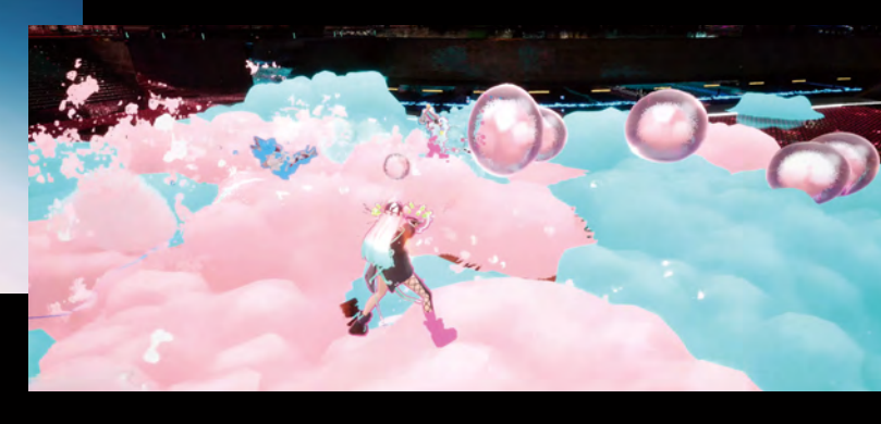
Platforms: PlayStation®5/PlayStation®4 Launch: Early 2024 (tentative) © SQUARE ENIX