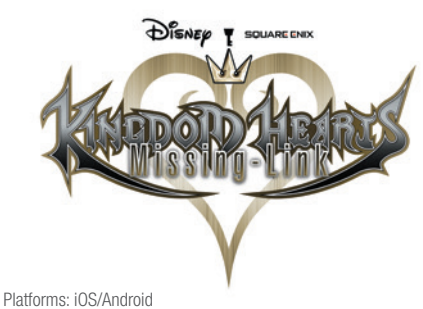
© Disney. © Disney/Pixar. Developed by SQUARE ENIX