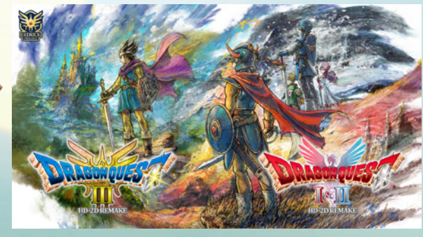
Platforms: Nintendo Switch™/PlayStation®5/Xbox Series XIS/Steam®/Windows® Launch: November 14, 2024 (for Steam®: November 15, 2024) © ARMOR PROJECT/RIRD STUDIO/SPIKE CHUNSOFT/SOLIARE ENIX

© ARMOR PROJECT/BIRD STUDIO/SPIKE CHUNSOFT/SQUARE ENIX