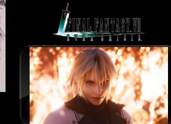
© SQUARE ENIX Powered by Applibot, Inc. CHARACTER DESIGN: TETSUYA NOMURA / CHARACTER ILLUSTRATION: LISA FUJISE