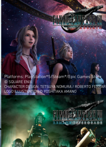
Platforms: PlayStation®5/Steam®/Epic Games Store Launch for Nintendo Switch™ 2/Xbox Series XIS/ Microsoft Store on Windows: January 22, 2026 (tentative) © SQUARE ENIX CHARACTER DESIGN: TETSUYA NOMURA / ROBERTO FERRARI LOGO ILLUSTRATION: © YOSHITAKA AMANO