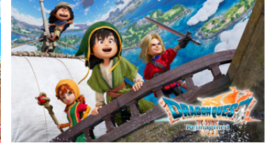
Platforms: Nintendo Switch™ 2/Nintendo Switch™/PlayStation®5/ Xbox Series XIS/Steam®/Microsoft Store on Windows Launch: February 5, 2026 (for Steam®: February 6, 2026) (tentative) © ARMOR PROJECT/BIRD STUDIO/SQUARE ENIX