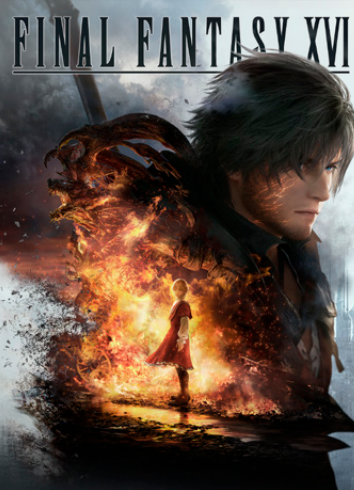
Platforms: PlayStation®5/Steam®/Epic Games Store/Xbox Series XIS/Microsoft Store on Windows © SQUARE ENIX