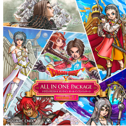
Platforms: Windows®/PlayStation®4/Nintendo Switch™ © ARMOR PROJECT/BIRD STUDIO/SQUARE ENIX