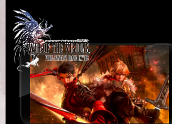
© SQUARE ENIX Co-Developed by gumi Inc. LOGO ILLUSTRATION: © YOSHITAKA AMANO