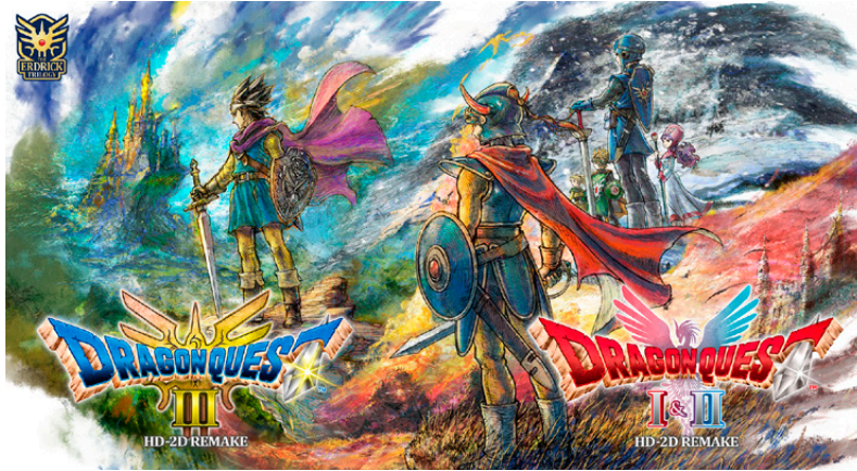
Platforms: Nintendo Switch™/PlayStation®5/Steam®/ Xbox Series XIS/Microsoft Store on Windows © ARMOR PROJECT/BIRD STUDIO/SPIKE CHUNSOFT/SQUARE ENIX

Since the launch of “DRAGON QUEST” for the Nintendo Entertainment System in 1986, DRAGON QUEST has been a popular roleplaying game series worldwide. The series continuously offers contemporary gaming experiences for each title by actively utilizing new technology such as 3D maps, StreetPass wireless communication, online gaming, cloud gaming and more.