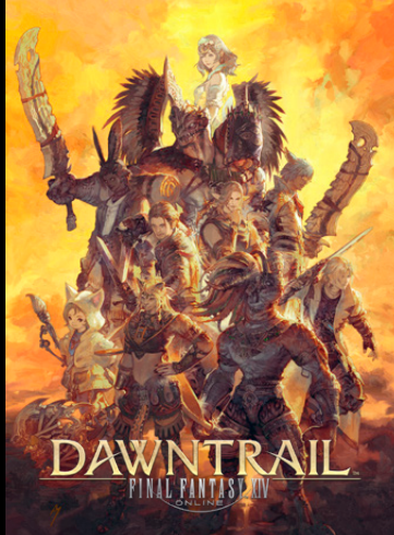
Platforms: PlayStation®5/PlayStation®4/ Xbox Series XIS/Windows®/Mac/Steam® © SQUARE ENIX LOGO ILLUSTRATION: © YOSHITAKA AMANO

A role-playing game series originating from Japan, FINAL FANTASY has been highly acclaimed by players around the world since the release of its first title in 1987. Known for its cutting-edge visual technology, distinctive worldbuilding, and rich storytelling, the franchise has captivated audiences across the globe. Through its active expansion into Western markets, cumulative global shipments and digital downloads have now exceeded 204 million units.