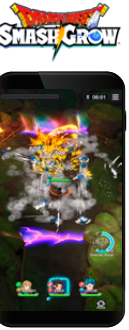
© ARMOR PROJECT/ BIRD STUDIO/SQUARE ENIX Developed by KLabGames Launch: 2026 (tentative)