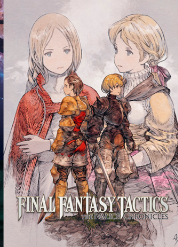
Platforms: Nintendo Switch™ 2/Nintendo Switch™/ PlayStation®5/PlayStation®4/Xbox Series XIS/Steam® © SQUARE ENIX